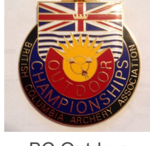
BC Outdoor Championships